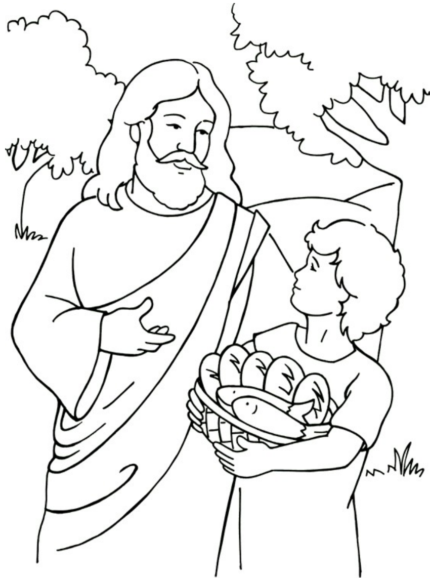
Jesus Feeds the 5000

From Thru-the-Bible Coloring Pages © 1986, 1988 Standard Publishing. Used by permission. Reproducible Coloring Books may be purchased from Standard Publishing, www.standardpub.com , 1-800-323-7543.